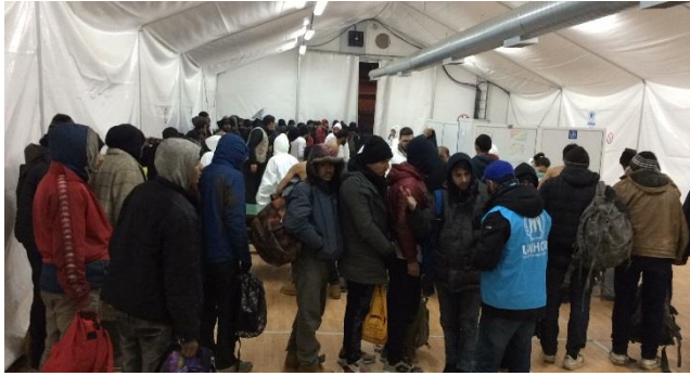
New arrivals transferred from the North on 11 January undergoing reception procedure, Presevo RC (Serbia) UNHCR, 11 January 2017

With the arrival of 167 men from the North, there are now over 1,230 refugees, asylum-seekers and migrants accommodated in two Reception Centres (RC): Presevo (1,016) and Bujanovac (221). Some 45% of residents of Presevo RC are from Afghanistan, 22% from Iraq, 17% from Pakistan, and 6% from Syria. Bujanovac RC, accommodates only families and unaccompanied and separated children, from Syria (32%), Iraq (29%), and Afghanistan (26%), with 13% others.