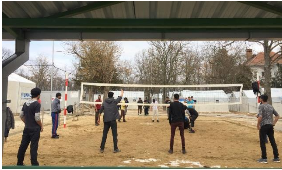
Sports in Presevo Reception Centre, Presevo (Serbia), 09 February 2017